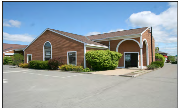
Leased 4,000 s/f unit (under renovations)