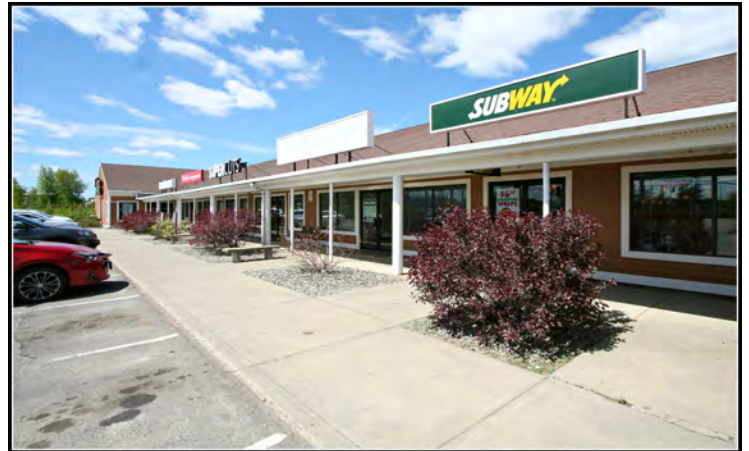
Several in-line vacant units