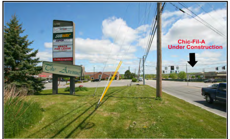
Major Stillwater Avenue Frontage