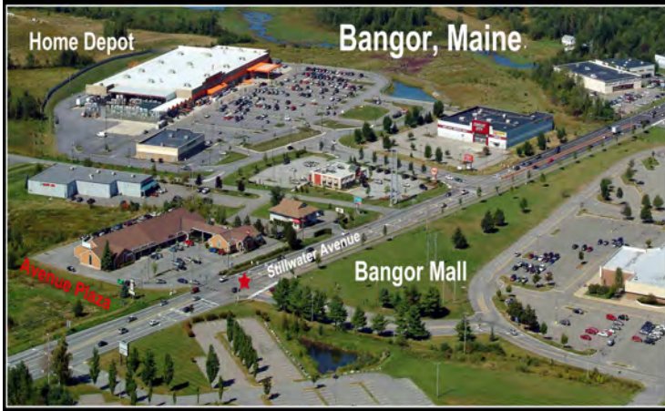
Prime Location at signaled intersection